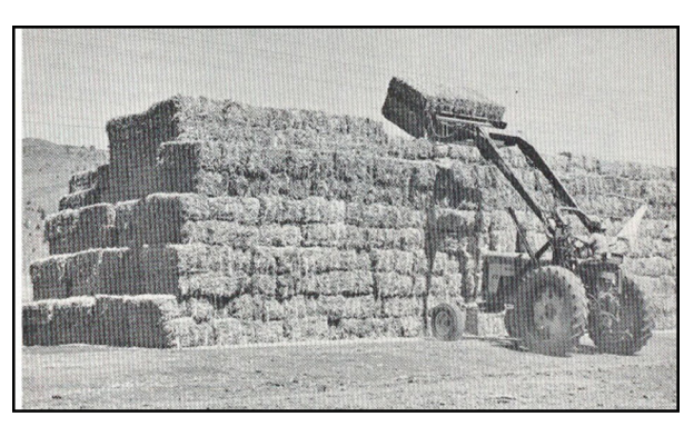
FAST, E-Z unloading from truck to hay stack or loading from hay stack to truck, with a Newhouse Bale Squeeze