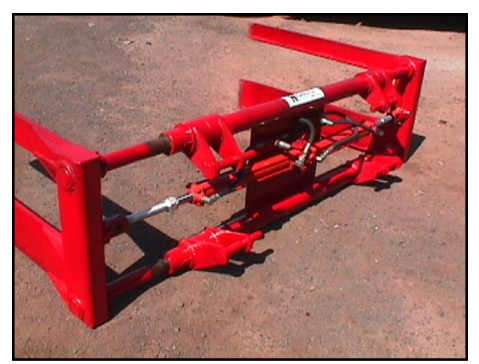
THIS PICTURE SHOWS THE REAR VIEW OF THE SQUEEZE, SHOWING THE CYLINDERS AND UNIVERSAL LOADER MOUNTING BRACKETS