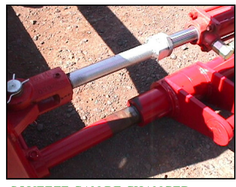
SQUEEZE CAN BE CHANGED FROM AN 8 TO 10 BALE (OR VICE VERSA) BY REMOVING OR ADD-ING CYLINDER EXTENSIONS, AND SHORTENING OR REPLACING SLIDE BARS.