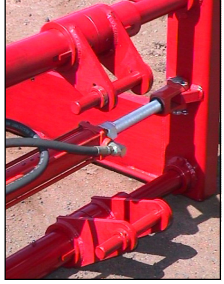
HOOK UP BRACKETS FOR LOADER ARE VERY UNIVERSAL. THE BRACKETS SLIDE ON A HEAVY KEYED TUBING FOR ANY WIDTH, TURN OVER FOR VERTICAL SPACING IF NECESSARY. THE BRACKETS ARE ALSO 2 PIECES SO SPACING CAN BE SET FOR LOADER ARM WIDTH.