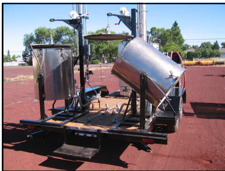
EOS STILL IN DUMPING POSITION WITH NEW CUTOUT IN TRAILER TO ALLOW FOR EASIER DUMPING