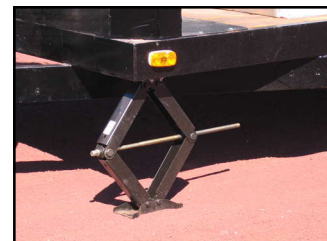
LEVELING JACKS ARE MOUNTED ON ALL FOUR CORNERS OF THE DECK TO STABILIZE THE TRAILER DURING OPERATION