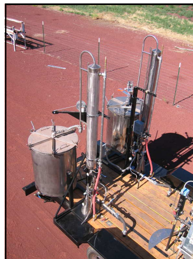
NEW!! ALL PLUMBING IS RUN UNDERNEATH THE TRAILER FOR AN OPEN CLEAN WORK SPACE

VISIT US ON THE WEB FOR MORE INFO ON OUR FULL LINE OF DISTILLATION EQUIPMENT, AND MORE