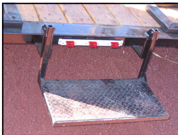
NEW!! FLIP DOWN STEP ON THE BACK OF THE TRAILER ALLOWS FOR EASY ACCESS TO THE REAR DECK