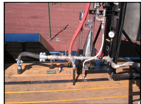
STEAM & WATER MANIFOLDS ARE USED FOR EASY ADDITION OF SECOND STALL AND FOR CONSOLIDATED PLUMBING