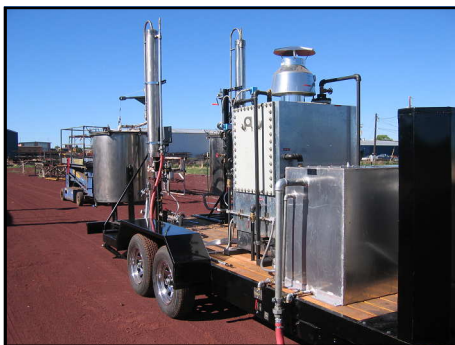
AN ALUMINUM FEED WATER TANK IS INCLUDED TO FEED THE BOILER AND FOR CONDENSER COOLING WATER