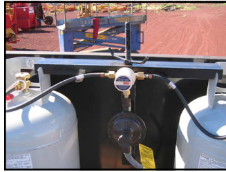
COMPLETE PROPANE SYSTEM IS INSTALLED ON THE TRAILER FROM 2, 25 GAL TANKS TO THE BOILER