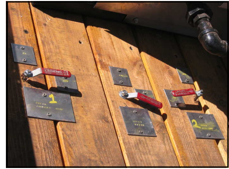
NEW!! ALL CONTROL VALVES ARE CLEARLY LABELED FOR EASY OPERATION