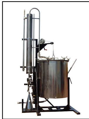
STANDARD NEWHOUSE EOS STILLS ARE USED ON THE TRAILER FOR EASY REPLACEMENT AND ADDITION OF STILLS